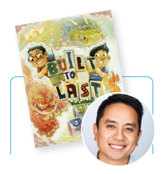
Author: Minh Lê Illustrator: Dan Santat