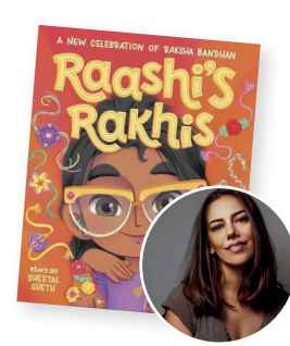
Author: Sheetal Sheth Illustrator: Lucía Soto